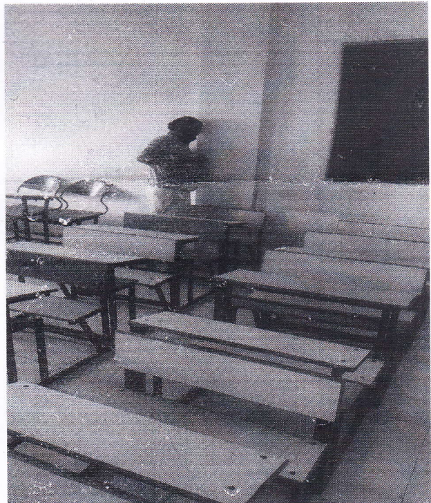
NTD Tests in class room