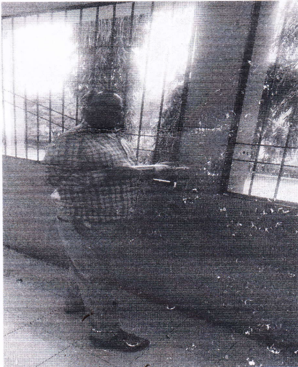
NTD Test in veranda