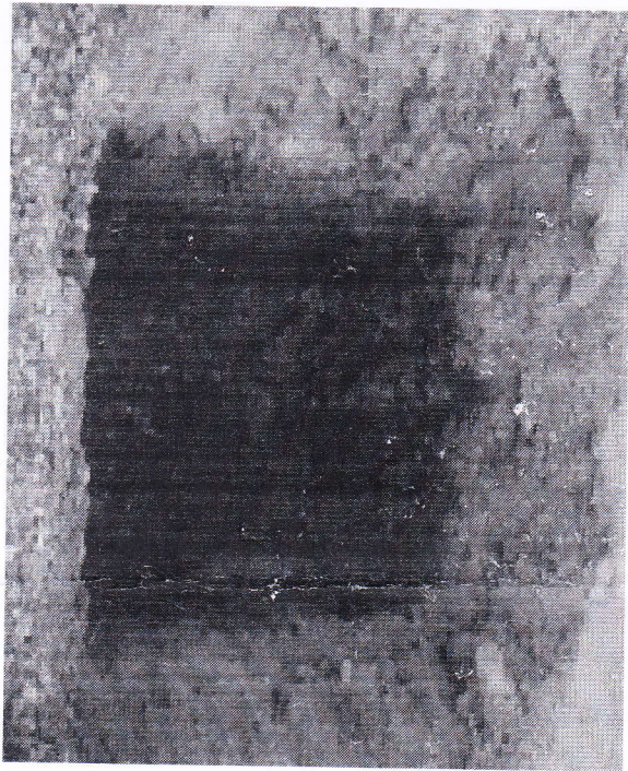
Soil pit for SBC