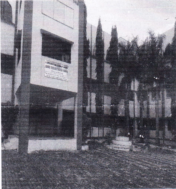
Front view, Glory English Medium School Building